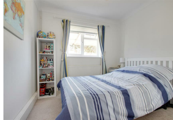
Bedroom Two 12'9 x 10'2 (3.89m x 3.10m)